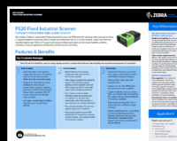
FS20 Fixed Industrial POE Scanner Battlecard