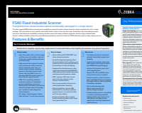
FS40 Fixed Industrial Auto Focus Scanner Battlecard