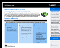
FS10 Fixed Industrial USB Scanner Battlecard