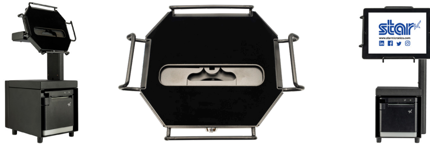
Tablet, Stand, and Printer are not included