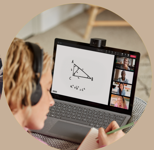
...and as seen by the remote participant