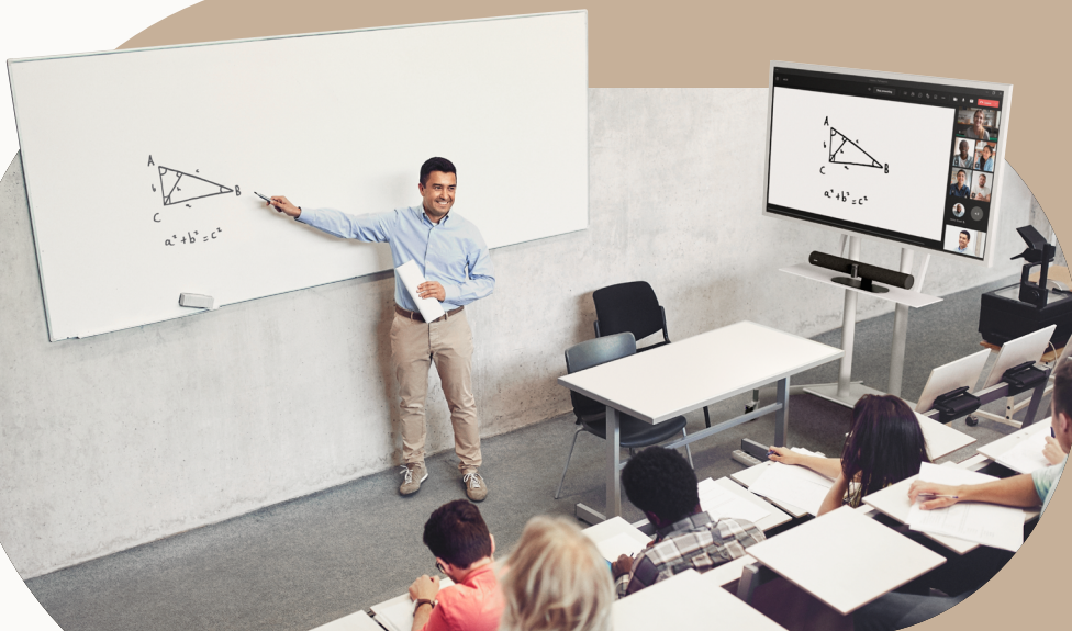
Sharing a whiteboard using Microsoft Teams...