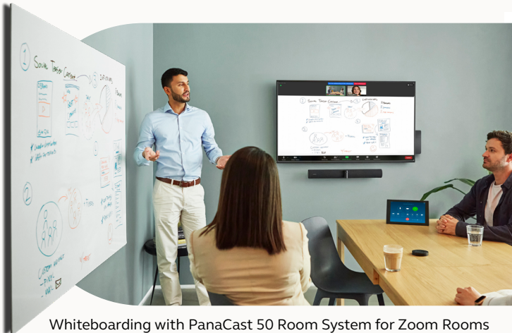
Whiteboarding with PanaCast 50 Room System for Zoom Rooms