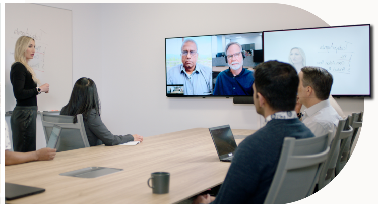
Whiteboarding with PanaCast 50 Room System for Teams Rooms