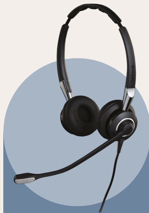
BIZ 2400 II